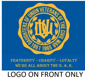
LOGO ON FRONT ONLY

One shirt is a Women's V-neck, 50/50 cotton poly blend, comes in Royal blue with DUVCW Logo, Fraternity, Charity and Loyalty and We're All