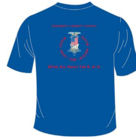
LOGO ON BACK ONLY